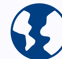
CORPORATE SOCIAL RESPONSIBILITY