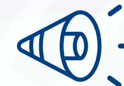
BRANDING & PROMOTION