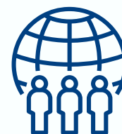
INDUSTRY CONNECTIONS & INTRODUCTIONS