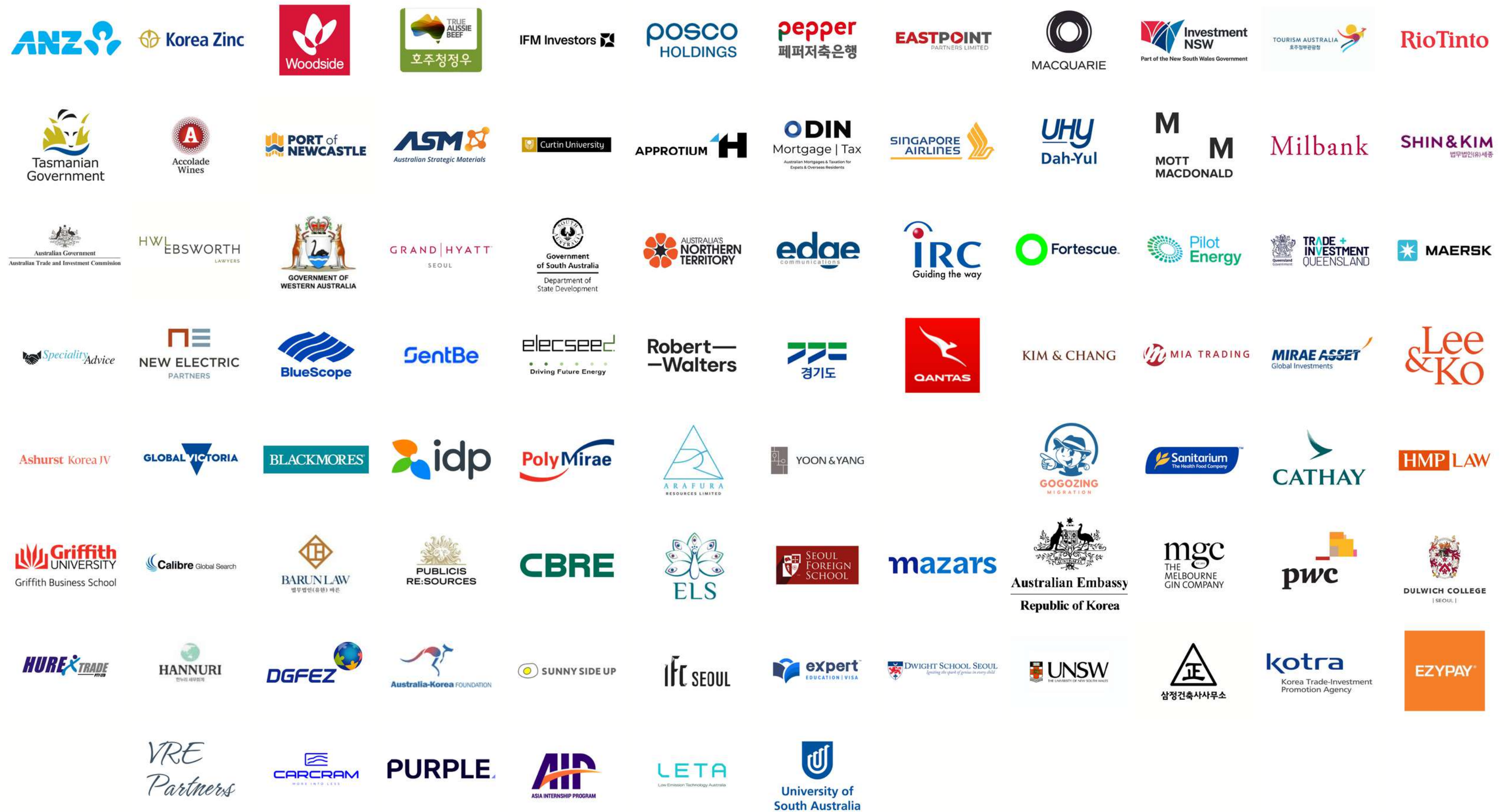
**A sample of members at AustCham Korea